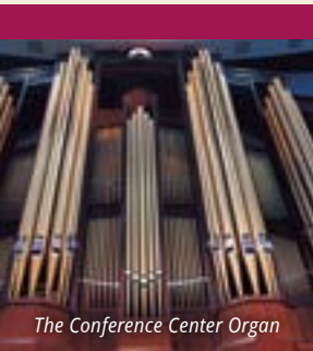
The Conference Center Organ