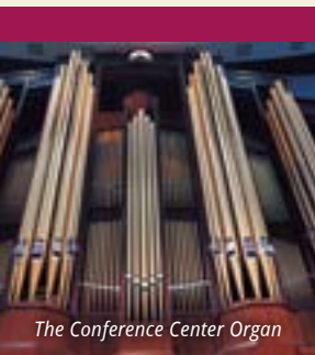
The Conference Center Organ