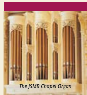
The JSMB Chapel Organ