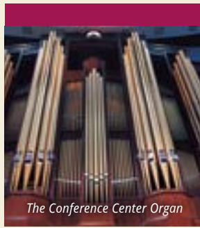
The Conference Center Organ