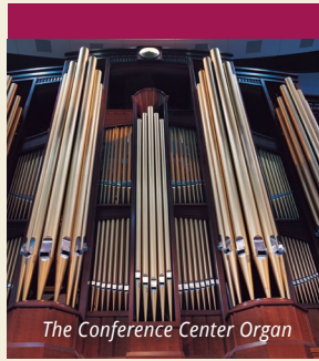
The Conference Center Organ